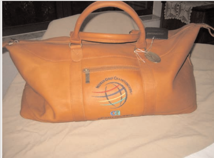
Plus 1 Phase 2 Prize- WGC-CA Championship Duffle Bag and a $20 gift card to Doral AleHouse.

It's Plus 1...Phase 2...for you. Sign 'em up for big prizes. Here's how it works: In this new phase you have the opportunity to win bigger prizes. All the entries from the first phase that ended Oct. 1st and anyone participating in this phase will be eligible for the next round of drawings. You will be entered into this drawing for each new recruit who becomes a volunteer. The number of entries per person are unlimited. When you recruit a new volunteer have them use the attached application and make sure they put your name in the box marked recommended by in the upper left portion of the form. The new deadline for entries is Feb. 1st or when all available spots are filled, whichever comes first. If they do not put your name in the recommended by box, you will not be given credit.