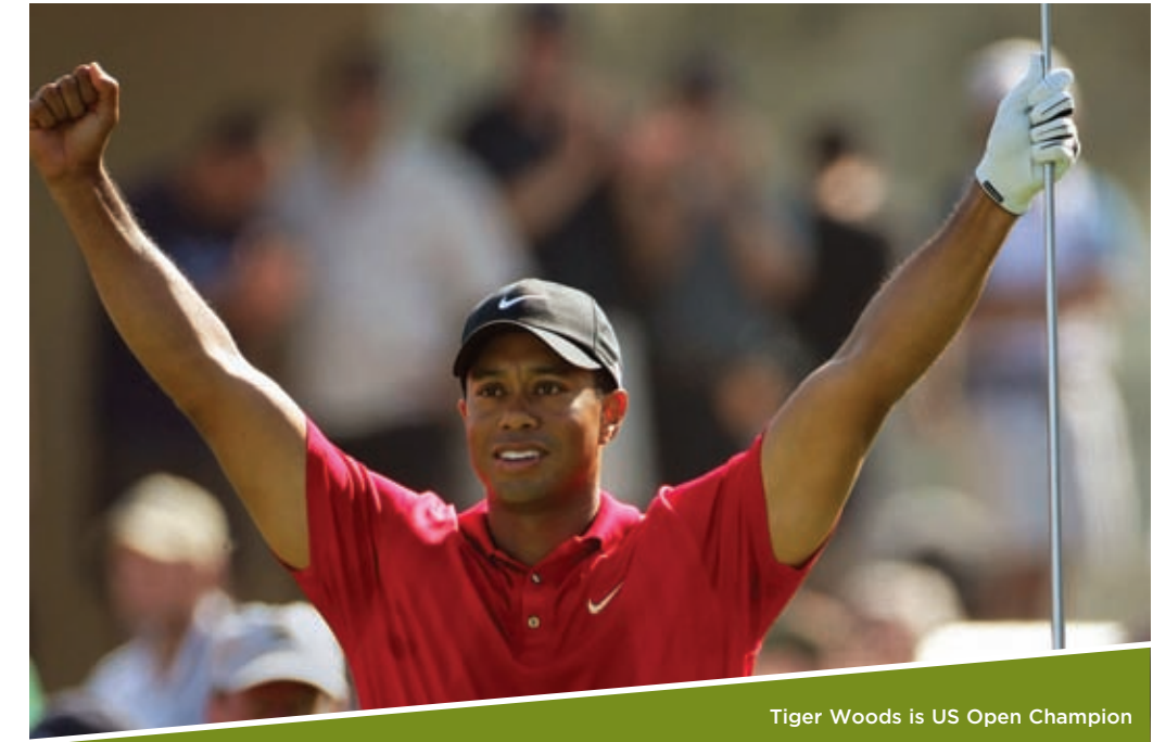
Tiger Woods is US Open Champion

After winning a brilliant 91-hole duel with Rocco Mediate and capturing his third U.S. Open, Tiger Woods stepped aside for the remainder of the season to mend a damaged left knee.