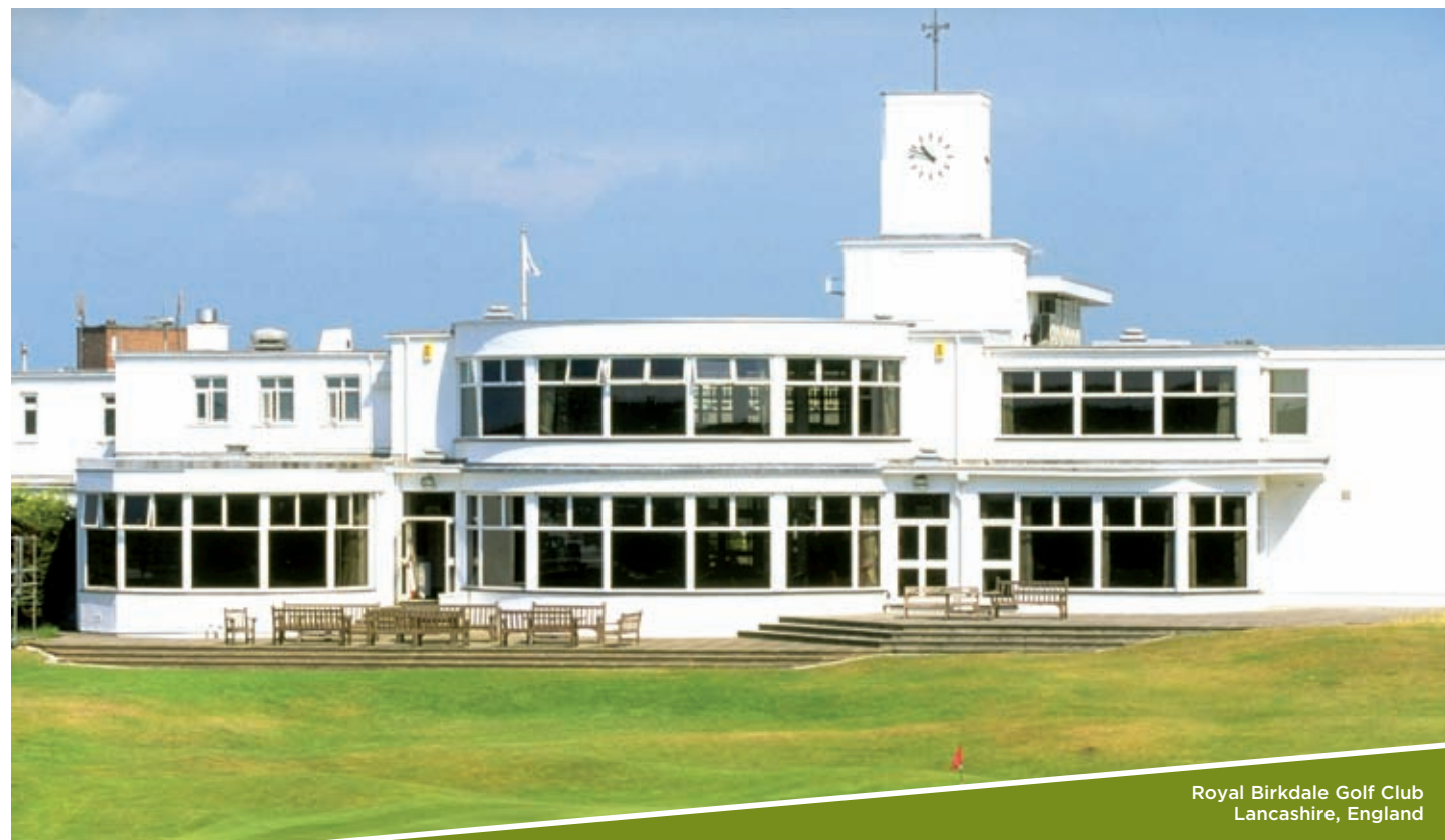
Royal Birkdale Golf Club Lancashire, England