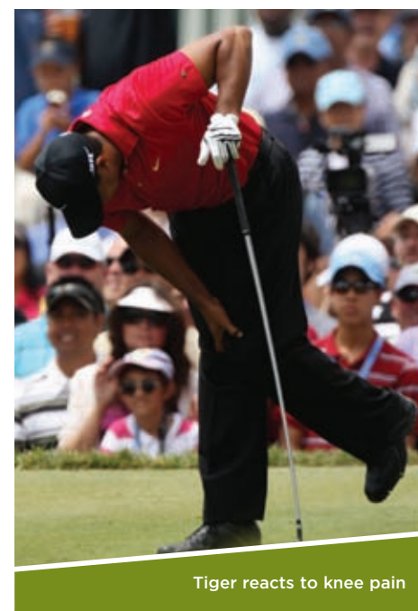
Tiger reacts to knee pain

Woods had delivered many spectacular moments over four days along the Pacific bluffs, and only needed a two-putt par to win the U.S. Open for the third time, and the first since it last was held on a public course at Bethpage Black in 2002.