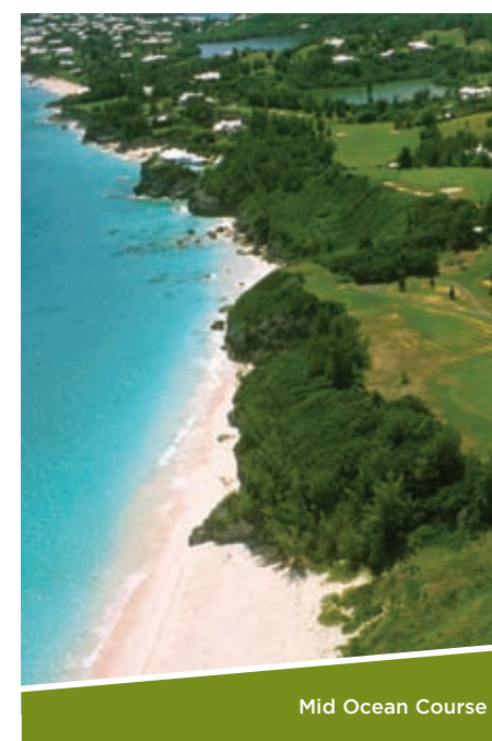
Mid Ocean Course

"I never quit. I never quit," Mediate said. "I've been beaten down a few times and came back, and I got what I wanted. I got a chance to beat the best player in the world. And I came up just a touch short."