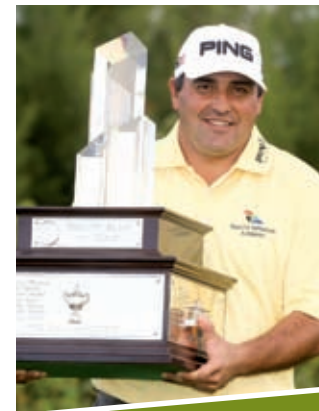
Angel Cabrera 2007 PGA Grand Slam Champion

90th PGA Championship August 7-10 Oakland Hills Country Club Bloomfield Township, Mich.