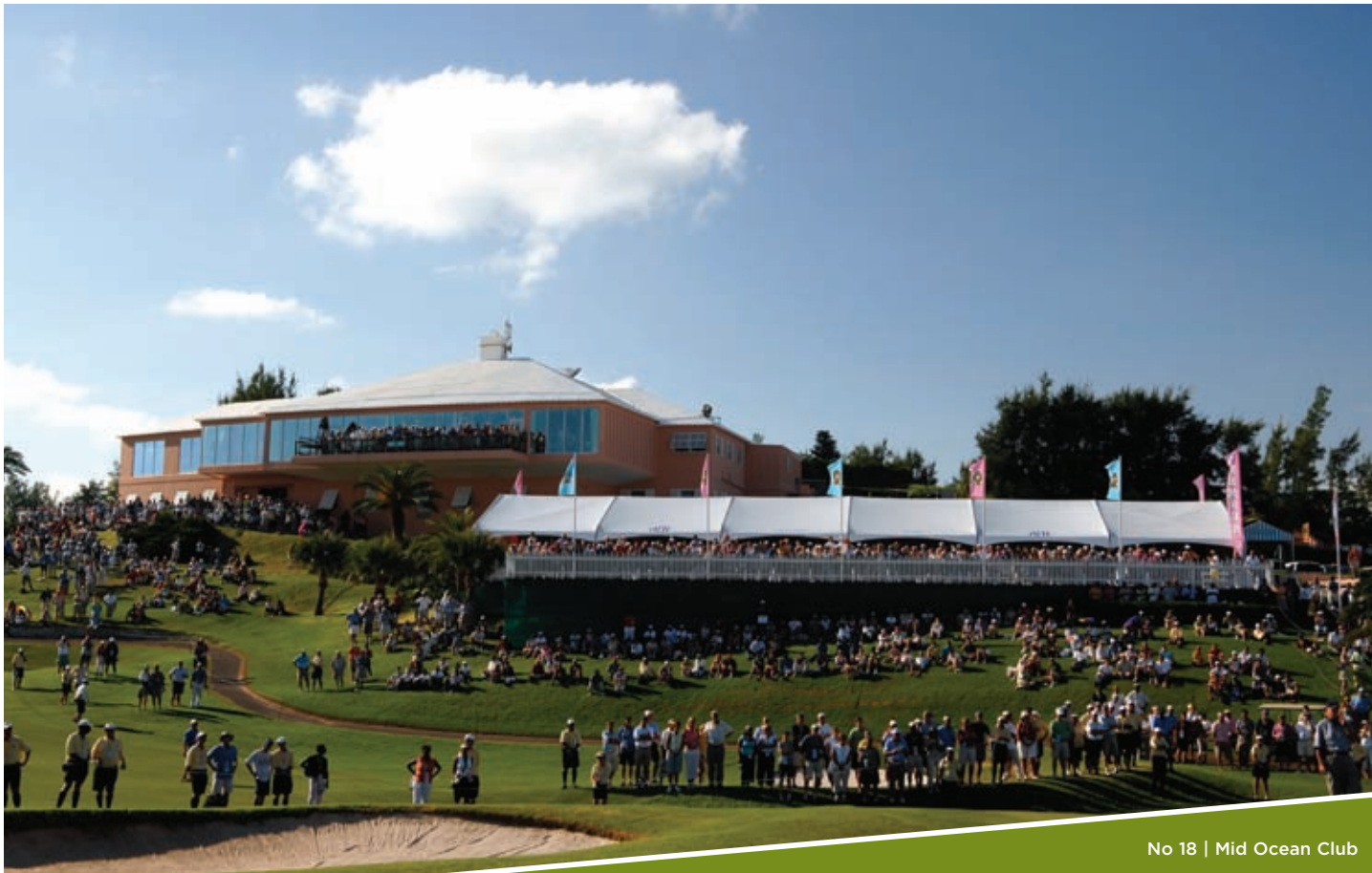
No 18 | Mid Ocean Club

© 2008 The PGA of America. All rights reserved. The PGA Seal with the letters PGA is a trademark owned by The PGA of America.