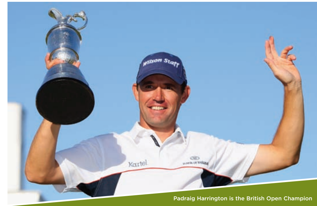
Padraig Harrington is the British Open Champion

Striding down the 18th fairway at Royal Birkdale, with a four-stroke lead in his pocket, Padraig Harrington paused to pay respects to the man who had been chasing him and history over the final round of the 137th British Open Championship.