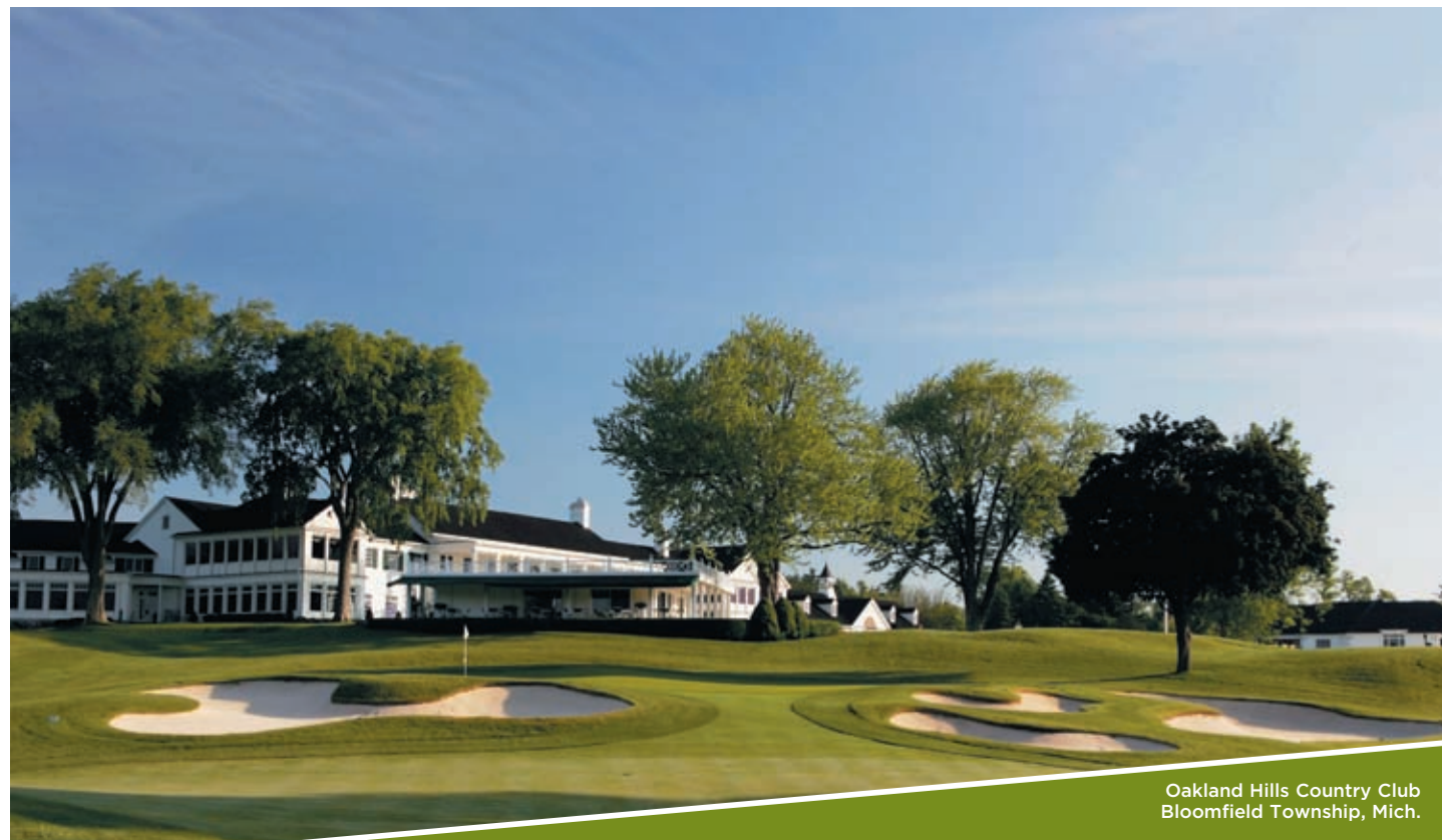
Oakland Hills Country Club Bloomfield Township, Mich.