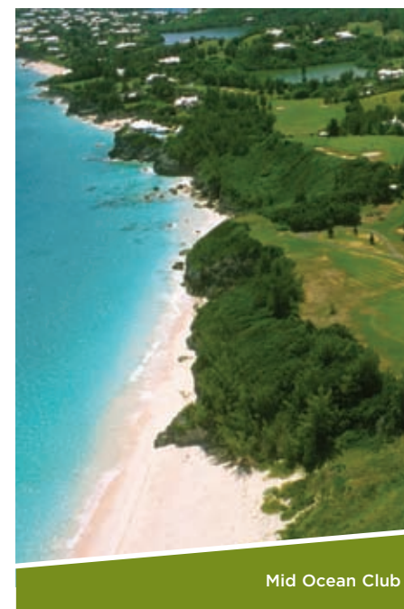
Mid Ocean Club

ones. Quite honestly, I'm sure I surprised a lot of people.”